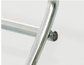
Cutted with wire tray shears