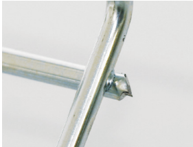
Bolt cutter, nipped off